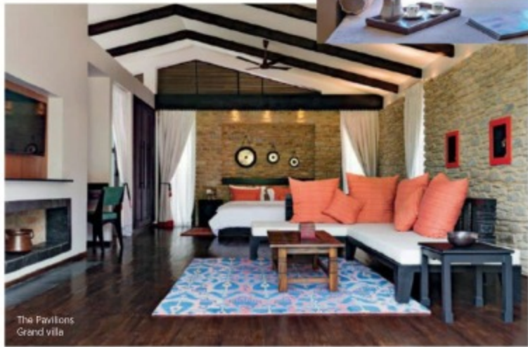
The Pavilions Grand villa