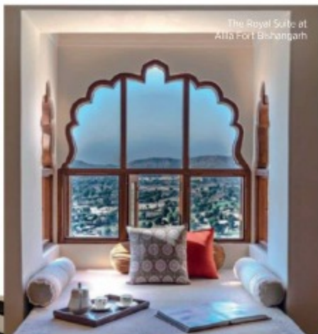
The Royal Suite at Alila Fort Bishangarh

Unlike most of northern India's romantic heritage hotels, Bishangarh began life as an 18 th -century hilltop fortress rather than an opulent palace. Situated high atop a granite hill with 360-degree views of the surrounding Rajasthani landscape, it's easy to see why TIME magazine included the hotel in its list of the World's Greatest Places in 2018. The secret of its successful transition was the construction of new wings to house 59 lavish guest suites, two restaurants, a cocktail bar and a state-of-the-art spa that all combine traditional style with contemporary comforts.