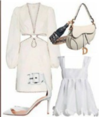
Clockwise from top left: Dress, $1,157, Zimmermann at Farfetch. Bag, Dior. Top, about $856, Cecile Bahsen at MatchesFashion.com. Pump, Aquazzura